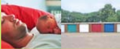
inside your storage unit