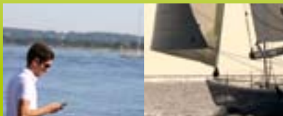
in your boat or caravan