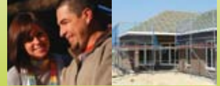
for your house under construction